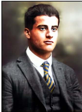
Blessed Pier Giorgio Frassati

The Spirit of the Lord has filled the whole world and that which contains all things understands what is said, alleluia.